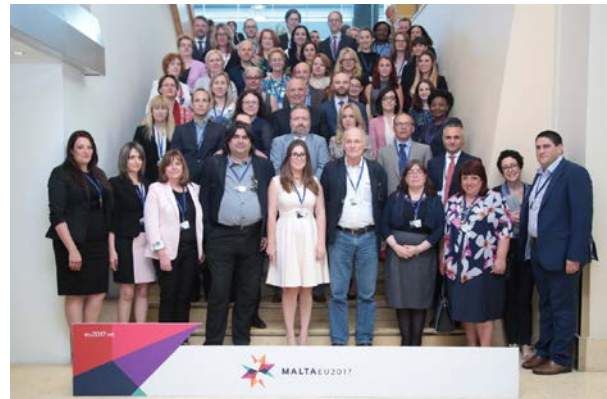
Delegates at the EMN Conference 2017 in Malta

The organisers brought together more than 250 experts from different fields (e.g. engaged in law enforcement and/or migration) from all EU Member States. In several panel discussions, speakers from the European Commission, EU agencies, inter-governmental and non-governmental organisations, academia and selected EU and non-EU countries presented their views on the implementation of the Common European Asylum System, including the current situation of asylum flows and possible future trends, the asylum procedures and reception conditions in the EU, existing legal pathways and resettlement programmes. Participants also discussed intra-EU solidarity and cooperation with third countries. The conference brought to the fore different asylum practices and lessons learned from various Member States.