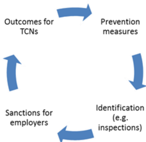
Figure 1: Illegal employment policy cycle