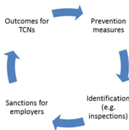
Figure 2: Illegal employment policy cycle

Figure 2 below depicts the different steps of illegal employment policy as a cycle. Firstly, the prevention measures and incentives for both employers and employees are depicted as a first step in the policy cycle. This is followed by identification of illegal employment through inspections and other measures which in turn leads to sanctions for employers and different outcomes for migrants (such as return to the country of origin or regularisation of stay and employment). It is recognised that the various steps do not necessarily follow chronologically from each other; however, the notion of a cycle is used in the Study for organisational purposes, as it helps to highlight the different aspects which the analysis will focus on.